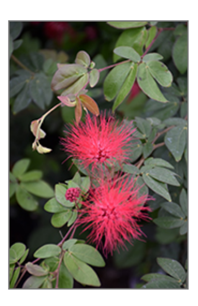
Dwarf Powderpuff flowers

When grown indoors, Dwarf Powderpuff can be expected to grow to be about 3 feet tall at maturity, with a spread of 4 feet. It grows at a fast rate, and under ideal conditions can be expected to live for approximately 30 years. This houseplant will do well in a location that gets either direct or indirect sunlight, although it will usually require a more brightly-lit environment than what artificial indoor lighting alone can provide. It does best in average to evenly moist soil, but will not tolerate standing water. The surface of the soil shouldn't be allowed to dry out completely, and so you should expect to water this plant once and possibly even twice each week. Be aware that your particular watering schedule may vary depending on its location in the room, the pot size, plant size and other conditions; if in doubt, ask one of our experts in the store for advice. It is not particular as to soil type or pH; an average potting soil should work just fine.