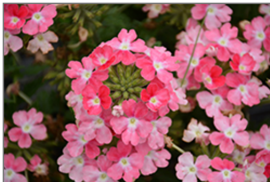
EnduraScape Pink Fizz Verbena flowers

EnduraScape Pink Fizz Verbena is recommended for the following landscape applications;