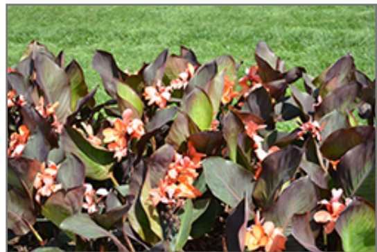
CannaSol Happy Wilma Canna in bloom