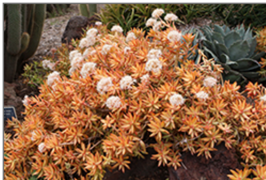
Firestorm Stonecrop in bloom