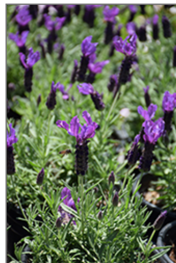
Javelin Forte Deep Purple Lavender flowers

Javelin Forte Deep Purple Lavender is recommended for the following landscape applications;