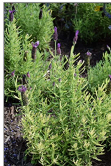
Javelin Forte Deep Purple Lavender in bloom

Javelin Forte Deep Purple Lavender makes a fine choice for the outdoor landscape, but it is also well-suited for use in outdoor pots and containers. It is often used as a 'filler' in the 'spiller-thriller-filler' container combination, providing a mass of flowers and foliage against which the thriller plants stand out. Note that when grown in a container, it may not perform exactly as indicated on the tag - this is to be expected. Also note that when growing plants in outdoor containers and baskets, they may require more frequent waterings than they would in the yard or garden.