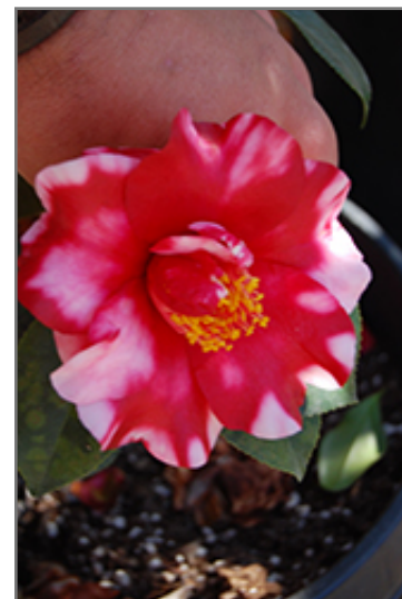
Midnight Variegated Camellia flowers