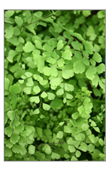
Delta Maidenhair Fern foliage

When grown indoors, Delta Maidenhair Fern can be expected to grow to be about 24 inches tall at maturity, with a spread of 24 inches. It grows at a slow rate, and under ideal conditions can be expected to live for approximately 15 years. This houseplant should be situated in a location that that gets indirect sunlight at most, although it will usually require a more brightly-lit environment than what artificial indoor lighting alone can provide. It prefers to grow in average to moist soil. The surface of the soil shouldn't be allowed to dry out completely, and so you should expect to water this plant once and possibly even twice each week. Be aware that your particular watering schedule may vary depending on its location in the room, the pot size, plant size and other conditions; if in doubt, ask one of our experts in the store for advice. It is particular about its soil conditions, with a strong preference for rich, alkaline soil. Contact the store for specific recommendations on pre-mixed potting soil for this plant. Be warned that parts of this plant are known to be toxic to humans and animals, so special care should be exercised if growing it around children and pets.