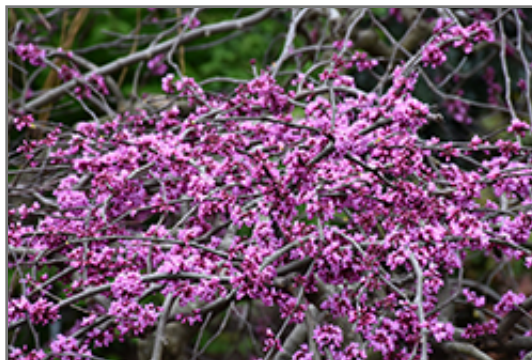
Traveller Weeping Redbud flowers

This is a relatively low maintenance shrub, and should only be pruned after flowering to avoid removing any of the current season's flowers. Deer don't particularly care for this plant and will usually leave it alone in favor of tastier treats. Gardeners should be aware of the following characteristic(s) that may warrant special consideration;