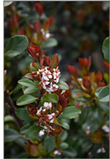
Redbird Indian Hawthorn flowers