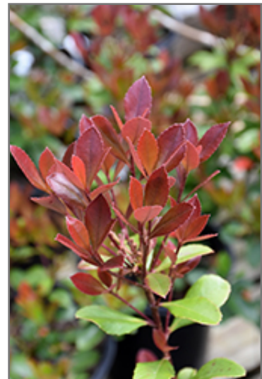
Redbird Indian Hawthorn foliage