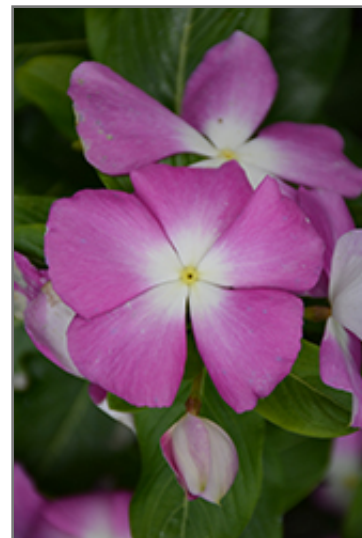
Mega Bloom Orchid Halo Vinca flowers

This plant will require occasional maintenance and upkeep, and should not require much pruning, except when necessary, such as to remove dieback. It is a good choice for attracting butterflies to your yard, but is not particularly attractive to deer who tend to leave it alone in favor of tastier treats. It has no significant negative characteristics.