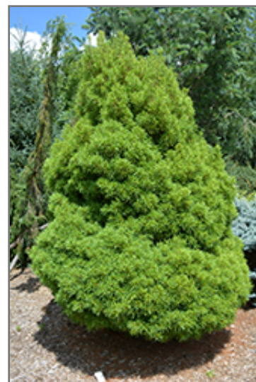
Tiny Kurls White Pine