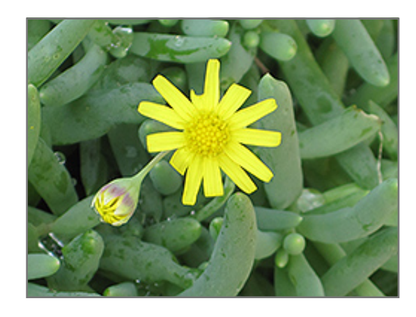
Little Pickles flowers

This plant will require occasional maintenance and upkeep, and usually looks its best without pruning, although it will tolerate pruning. It is a good choice for attracting bees and butterflies to your yard. It has no significant negative characteristics.