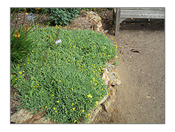
Little Pickles in bloom

Little Pickles will grow to be only 4 inches tall at maturity extending to 6 inches tall with the flowers, with a spread of 12 inches. It grows at a medium rate, and under ideal conditions can be expected to live for approximately 10 years. As an evegreen perennial, this plant will typically keep its form and foliage year-round.