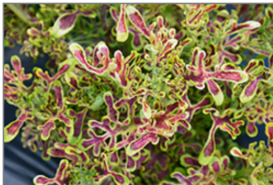
Under The Sea Red Coral Coleus foliage

Under The Sea Red Coral Coleus is recommended for the following landscape applications;