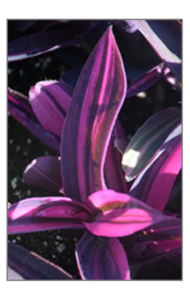
Pink Corazon Purple Heart foliage

When grown indoors, Pink Corazon Purple Heart can be expected to grow to be about 14 inches tall at maturity, with a spread of 4 feet. It grows at a fast rate, and under ideal conditions can be expected to live for approximately 10 years. This houseplant performs well in both bright or indirect sunlight and strong artificial light, and can therefore be situated in almost any well-lit room or location. It prefers to grow in average to moist soil. The surface of the soil shouldn't be allowed to dry out completely, and so you should expect to water this plant once and possibly even twice each week. Be aware that your particular watering schedule may vary depending on its location in the room, the pot size, plant size and other conditions; if in doubt, ask one of our experts in the store for advice. It is not particular as to soil type or pH; an average potting soil should work just fine.