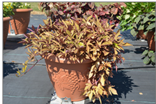
South of the Border Refried Beans Sweet Potato Vine