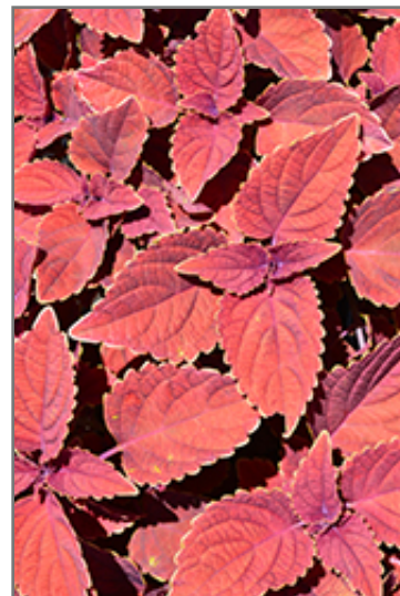
Color Clouds Valentine Coleus foliage

This is a relatively low maintenance plant. The flowers of this plant may actually detract from its ornamental features, so they can be removed as they appear. Deer don't particularly care for this plant and will usually leave it alone in favor of tastier treats. It has no significant negative characteristics.