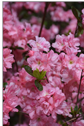
Sweetheart Supreme Azalea flowers

Sweetheart Supreme Azalea is recommended for the following landscape applications;