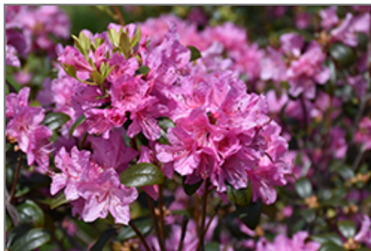
Little Olga Rhododendron flowers