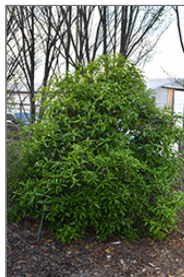
Apricot Gold Fragrant Tea Olive