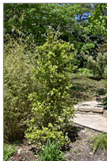
Green Shadow Variegated Nepal Holly