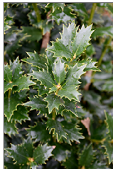
Acadiana Holly foliage