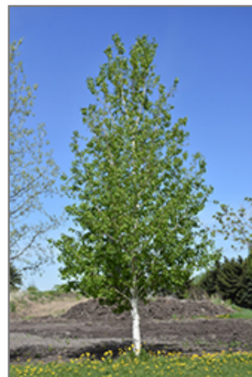
Pike Bay Quaking Aspen