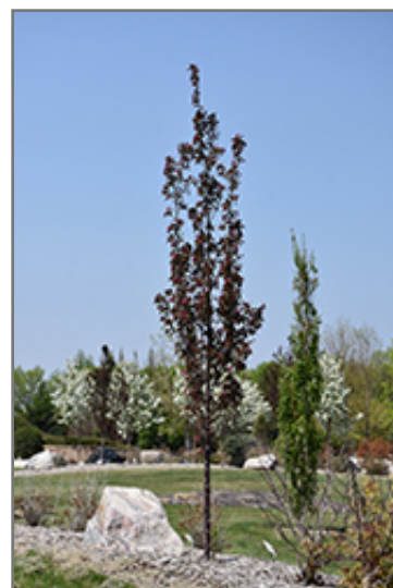
Royal Mist Flowering Crab in bloom