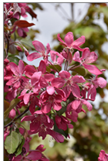
Royal Mist Flowering Crab flowers

Royal Mist Flowering Crab is recommended for the following landscape applications;