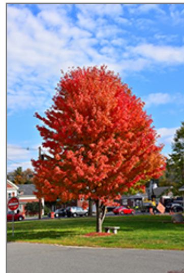
Autumn Splendor Sugar Maple in fall