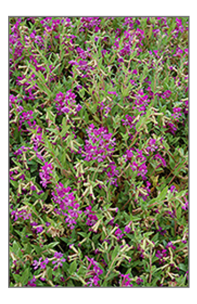
Sriracha Violet Cuphea flowers

When grown indoors, Sriracha Violet Cuphea can be expected to grow to be about 24 inches tall at maturity, with a spread of 24 inches. It grows at a medium rate, and under ideal conditions can be expected to live for approximately 10 years. This houseplant will do well in a location that gets either direct or indirect sunlight, although it will usually require a more brightly-lit environment than what artificial indoor lighting alone can provide. It does best in average to evenly moist soil, but will not tolerate standing water. The surface of the soil shouldn't be allowed to dry out completely, and so you should expect to water this plant once and possibly even twice each week. Be aware that your particular watering schedule may vary depending on its location in the room, the pot size, plant size and other conditions; if in doubt, ask one of our experts in the store for advice. It is not particular as to soil pH, but grows best in rich soil. Contact the store for specific recommendations on pre-mixed potting soil for this plant.