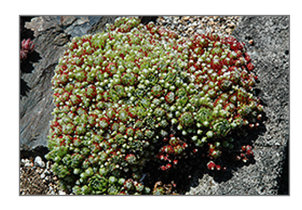
Hookeri Hens And Chicks

When grown indoors, Hookeri Hens And Chicks can be expected to grow to be only 3 inches tall at maturity extending to 8 inches tall with the flowers, with a spread of 12 inches. It grows at a medium rate, and under ideal conditions can be expected to live for approximately 20 years. This houseplant requires direct sun for optimal performance, and should therefore be situated in a room that gets bright sunlight for a good part of the day; it is not a good choice for rooms lit only by artificial light. It prefers dry to average moisture levels with very well-drained soil, and may die if left in standing water for any length of time. This plant should be watered when the surface of the soil gets dry, and will need watering approximately once each week. Be aware that your particular watering schedule may vary depending on its location in the room, the pot size, plant size and other conditions; if in doubt, ask one of our experts in the store for advice. It is not particular as to soil pH, but grows best in sandy soil. Contact the store for specific recommendations on pre-mixed potting soil for this plant.