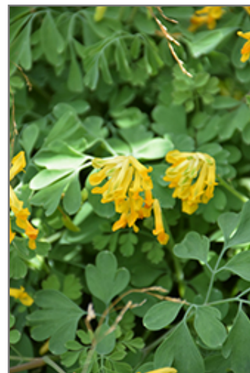
Golden Corydalis flowers