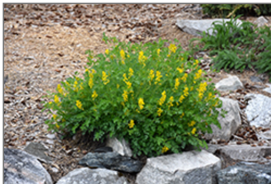
Golden Corydalis in bloom

Golden Corydalis will grow to be about 12 inches tall at maturity, with a spread of 12 inches. Its foliage tends to remain dense right to the ground, not requiring facer plants in front. It grows at a medium rate, and under ideal conditions can be expected to live for approximately 5 years. As an herbaceous perennial, this plant will usually die back to the crown each winter, and will regrow from the base each spring. Be careful not to disturb the crown in late winter when it may not be readily seen!