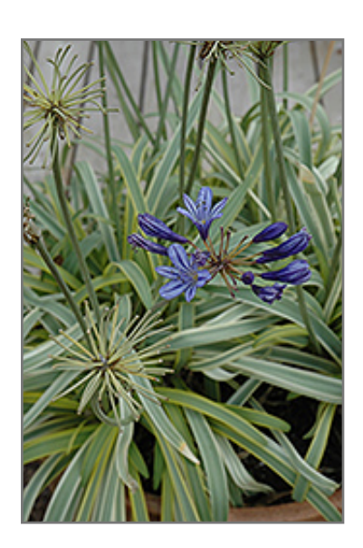
Gold Strike Agapanthus flowers

When grown indoors, Gold Strike Agapanthus can be expected to grow to be about 12 inches tall at maturity extending to 24 inches tall with the flowers, with a spread of 24 inches. It grows at a medium rate, and under ideal conditions can be expected to live for approximately 10 years. This houseplant will do well in a location that gets either direct or indirect sunlight, although it will usually require a more brightly-lit environment than what artificial indoor lighting alone can provide. It prefers to grow in average to moist soil. The surface of the soil shouldn't be allowed to dry out completely, and so you should expect to water this plant once and possibly even twice each week. Be aware that your particular watering schedule may vary depending on its location in the room, the pot size, plant size and other conditions; if in doubt, ask one of our experts in the store for advice. It is not particular as to soil type or pH; an average potting soil should work just fine.