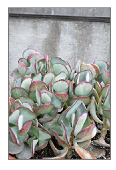
Silver Dollar Plant