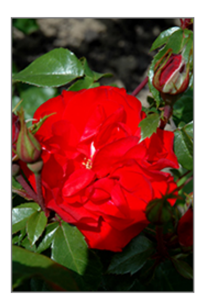
Sevillana Rose flowers