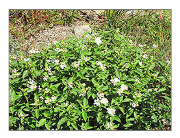
White Lightnin' Trailing Lantana in bloom

White Lightnin' Trailing Lantana is recommended for the following landscape applications;