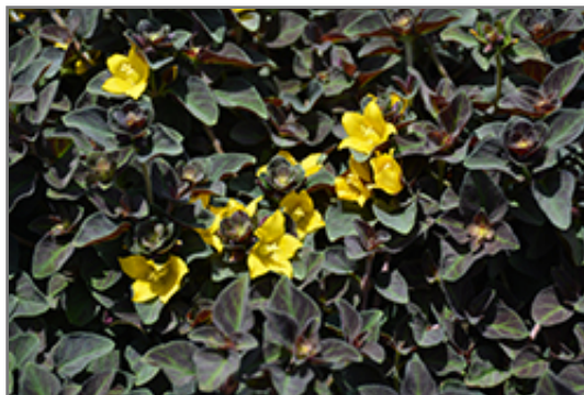
Midnight Sun Moneywort flowers

Midnight Sun Moneywort is recommended for the following landscape applications;