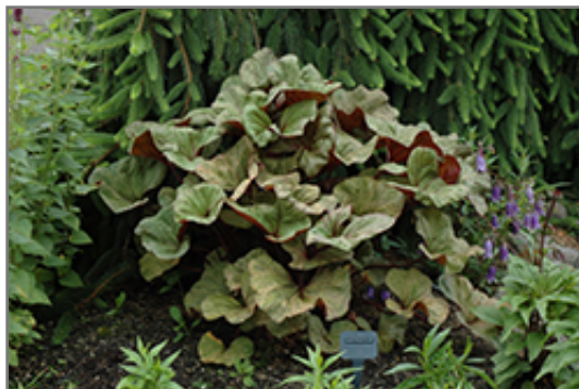
Garden Confetti Rayflower