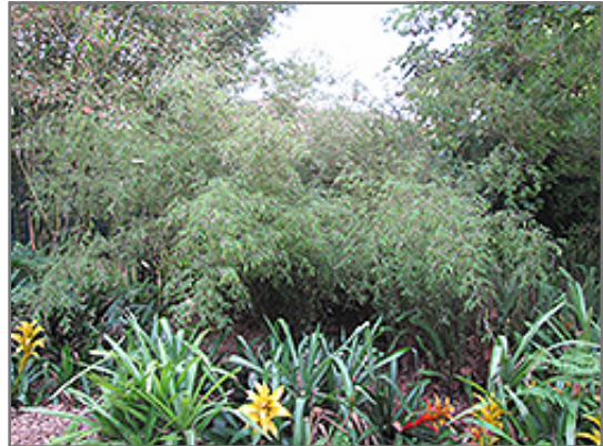
Narrow-Leaved Clumping Bamboo

Narrow-Leaved Clumping Bamboo is a fine choice for the garden, but it is also a good selection for planting in outdoor pots and containers. Because of its height, it is often used as a 'thriller' in the 'spiller-thriller-filler' container combination; plant it near the center of the pot, surrounded by smaller plants and those that spill over the edges. It is even sizeable enough that it can be grown alone in a suitable container. Note that when growing plants in outdoor containers and baskets, they may require more frequent waterings than they would in the yard or garden.