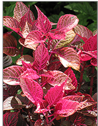
Linden's Blood Leaf foliage