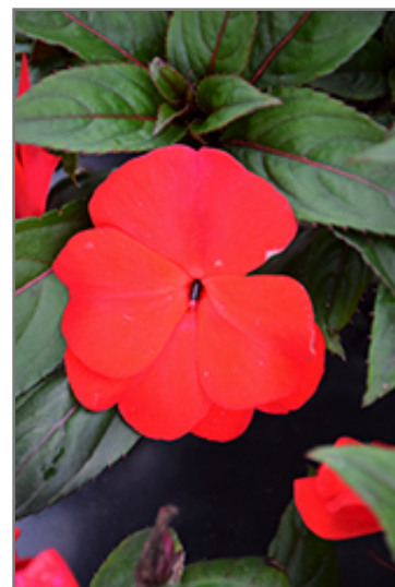
Divine Scarlet Bronze Leaf New Guinea Impatiens flowers

Divine Scarlet Bronze Leaf New Guinea Impatiens is recommended for the following landscape applications;