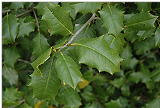
Big Red American Holly foliage

Big Red American Holly is recommended for the following landscape applications;