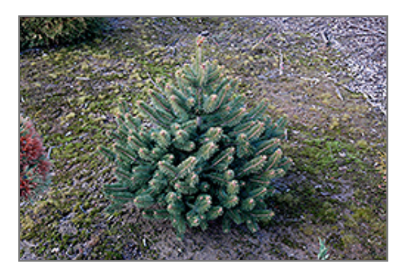
Donna's Rainbow Dwarf Colorado Spruce