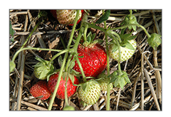
Titan Strawberry fruit

Titan Strawberry features dainty white cup-shaped flowers with lemon yellow eyes along the stems from mid to late spring. Its serrated round compound leaves remain dark green in color throughout the season. It features an abundance of magnificent red berries from late spring to early summer.