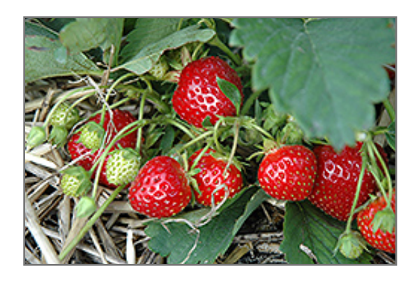
Itasca Strawberry fruit

This is an open herbaceous perennial with a spreading, ground-hugging habit of growth. Its relatively fine texture sets it apart from other garden plants with less refined foliage. This is a high maintenance plant that will require regular care and upkeep, and should not require much pruning, except when necessary, such as to remove dieback. It is a good choice for attracting birds to your yard, but is not particularly attractive to deer who tend to leave it alone in favor of tastier treats. Gardeners should be aware of the following characteristic(s) that may warrant special consideration;