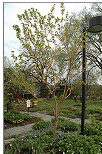
Erythrocladum Moosewood