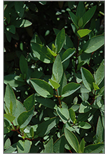
Thryallis foliage

This shrub does best in full sun to partial shade. It is very adaptable to both dry and moist growing conditions, but will not tolerate any standing water. It is not particular as to soil pH, but grows best in sandy soils. It is somewhat tolerant of urban pollution. Consider applying a thick mulch around the root zone in winter to protect it in exposed locations or colder microclimates. This species is not originally from North America.