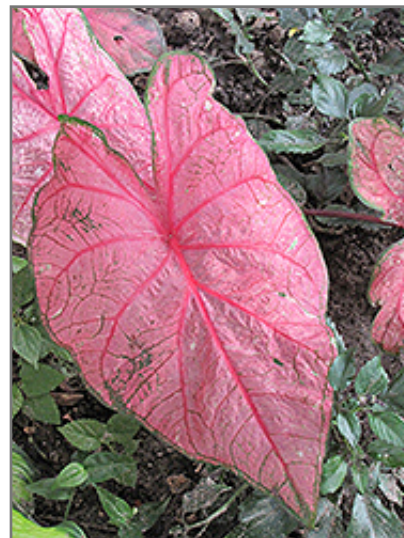
Fannie Munson Caladium foliage

Fannie Munson Caladium is recommended for the following landscape applications;