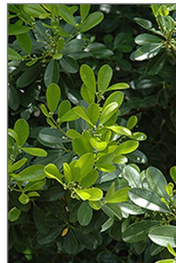
Perdido Holly foliage