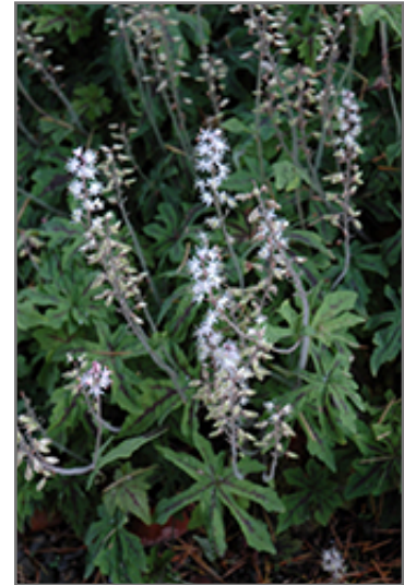
Oregon Trail Foamflower flowers

Vigorous and beautiful, the deep green leaves are deeply lobed and marked dark burgundy-brown filling up the center of the leaf; only a few white flowers appear in spring on short stems; great shaded groundcover under trees and along borders