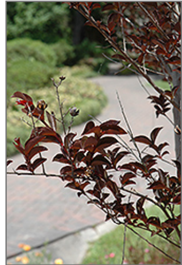
Delta Jazz Crapemyrtle foliage

Delta Jazz Crapemyrtle makes a fine choice for the outdoor landscape, but it is also well-suited for use in outdoor pots and containers. Its large size and upright habit of growth lend it for use as a solitary accent, or in a composition surrounded by smaller plants around the base and those that spill over the edges. It is even sizeable enough that it can be grown alone in a suitable container. Note that when grown in a container, it may not perform exactly as indicated on the tag - this is to be expected. Also note that when growing plants in outdoor containers and baskets, they may require more frequent waterings than they would in the yard or garden.