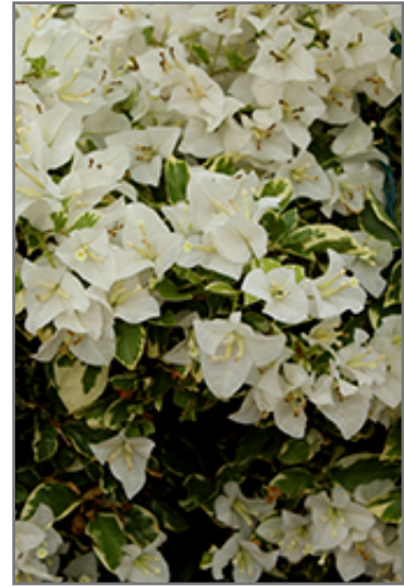
White Stripe Bougainvillea flowers