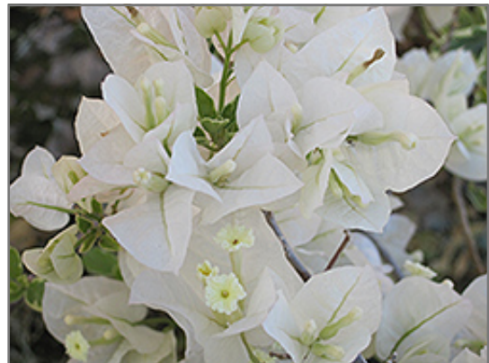
White Stripe Bougainvillea flowers