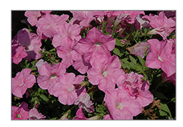
Perfectunia Rose Petunia flowers

landscape use; heat and drought tolerant