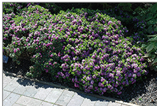
Cheriton Daphne in bloom