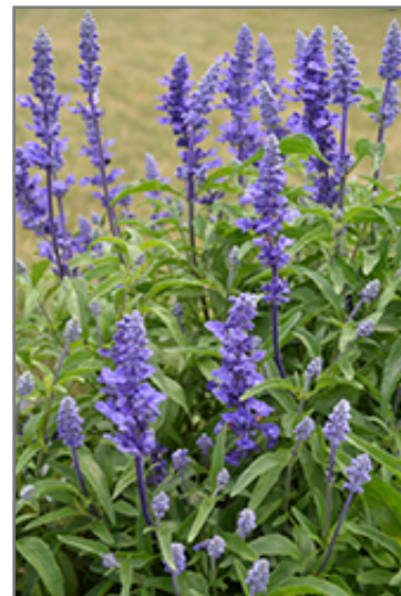
Victoria Blue Salvia flowers

Victoria Blue Salvia is recommended for the following landscape applications;