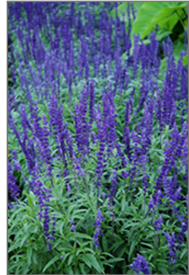
Victoria Blue Salvia flowers

Victoria Blue Salvia is a fine choice for the garden, but it is also a good selection for planting in outdoor pots and containers. With its upright habit of growth, it is best suited for use as a 'thriller' in the 'spiller-thriller-filler' container combination; plant it near the center of the pot, surrounded by smaller plants and those that spill over the edges. Note that when growing plants in outdoor containers and baskets, they may require more frequent waterings than they would in the yard or garden.